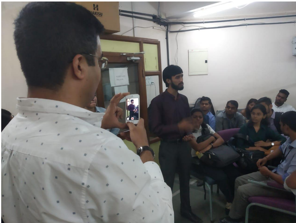
5. Screening of Movie, Bazaar, 6 th February, 2019.